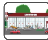
Stores and showrooms