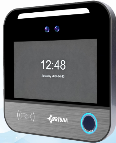
VF400X AI Face Recognition and Fingerprint