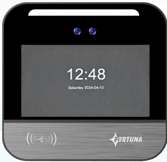
VF400 AI Face Recognition

Super smart landscape design based AI face recognition device with biometric reader option