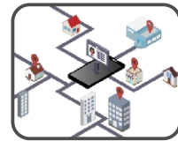
Cloud based attendance