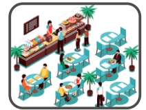
Canteen Token Management