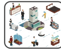
Amenity Booking Management