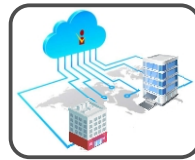
Cloud based Attendance