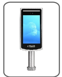
Turnstile Mounting Stand