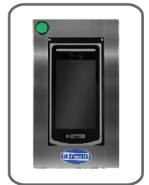
SS Panel for Protection